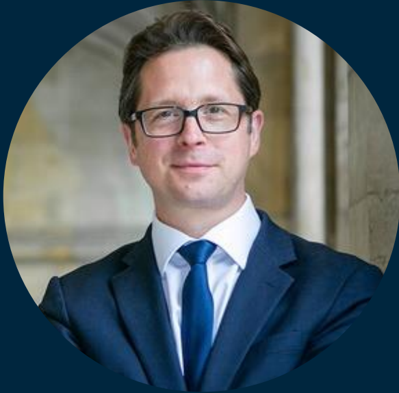
Alex Burghart MP, Minister for Skills